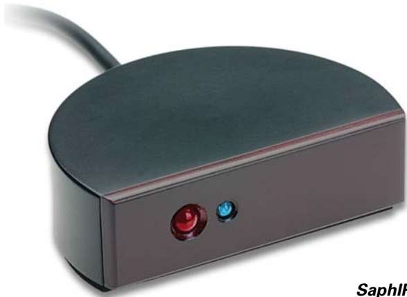
SaphIR 854 CFL friendly