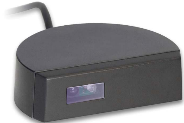
SaphIR 854P CFL and plasma friendly

The SaphIR 854 and 854P are compact tabletop infrared receivers that accept signals from a wide variety of IR remote controls. Typically used for controlling components hidden in a media cabinet or located in another room, they relay IR signals to the equipment through a connecting block and IR emitters.